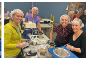
Feed My Starving Children