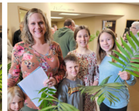
Palm Sunday & Easter Eggs!