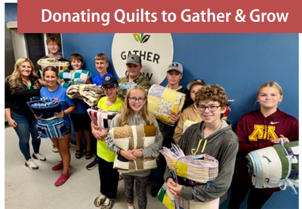
Donating Quilts to Gather & Grow