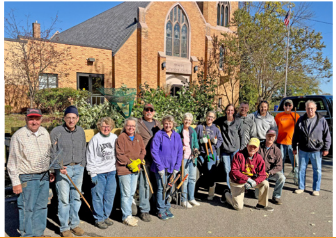
Many thanks to the Fall Clean-Up Crew!