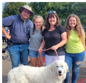
Outdoor Worship & Pet Blessing