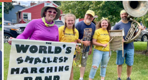
Rails to Trails Parade