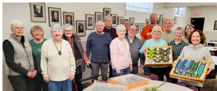
The OWLS Admiring Bugs and Butterflies