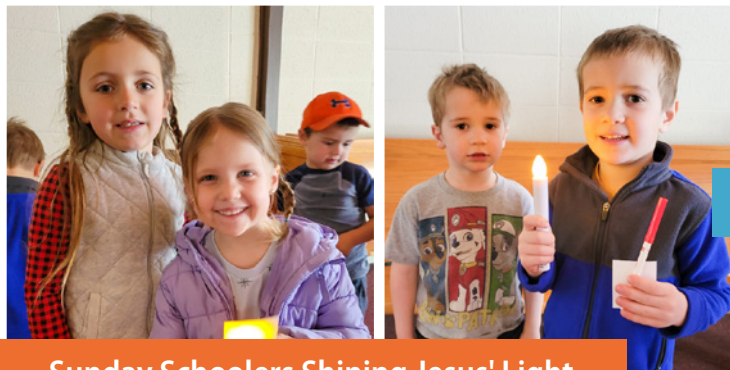
Sunday Schoolers Shining Jesus' Light