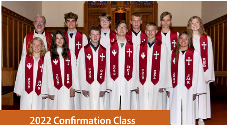
2022 Confirmation Class