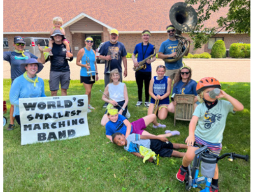
Trinity's World's Smallest Marching Band in the Rails to Trails Parade