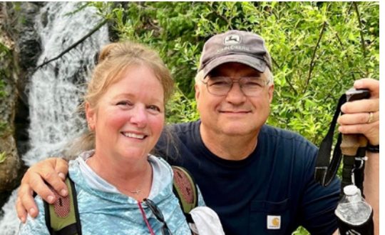
The Trinity crew enjoying Holden Village