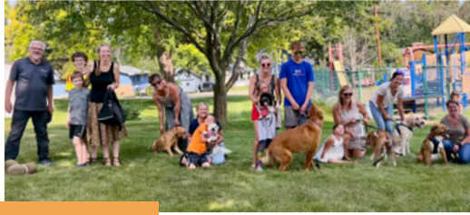
Blessing of the Pets Outdoor Service