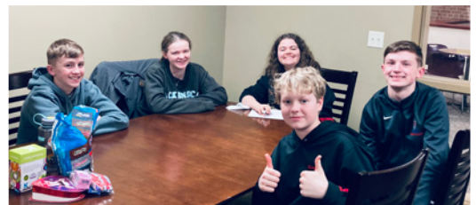
Youth Group Game Night