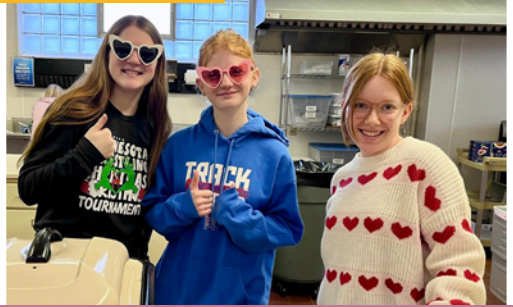
Valentine's Day Pasta Dinner Fundraiser