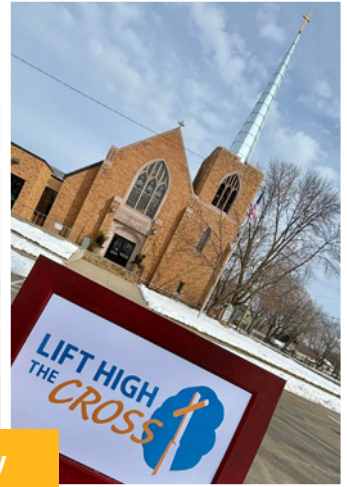
Stewardship Celebration Sunday