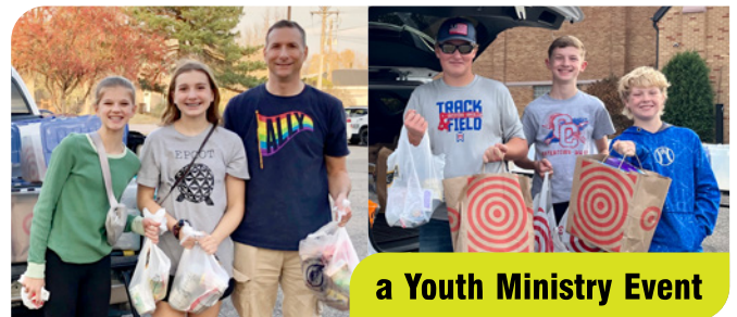
a Youth Ministry Event

If you can help with any of these items, please sign up at www.trin.org under EVENTS .